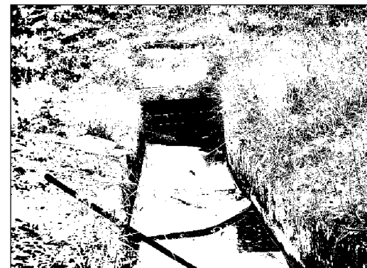
Oil in a stream

A guidance leaflet produced by the Oil Care Group