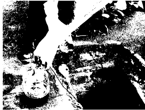
Oil contamination of a borehole

Ensure that oil tanks and pipework are fitted according to the requirements of the Building Bye-laws (Jersey) 2007*.