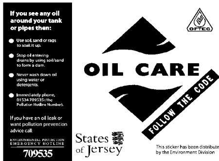
Oil tank sticker

All oil tanks must display an Oil Care sticker, so that the owner is aware of the pollution hotline number (stickers can be obtained from the Planning and Environment Department, tel: 441600).