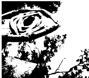
Oil on the surface of a pond

Oil is a highly visible form of pollution as it floats on the water's surface. It can dissolve into water, which makes it difficult and costly to clean up.