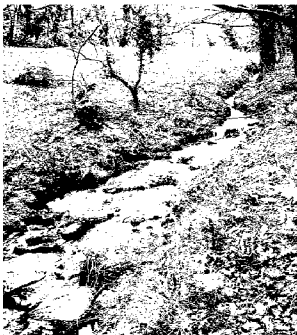
An Island stream

The Island's water resource supports a large diversity of wildlife and is essential for the provision of safe and clean drinking water.